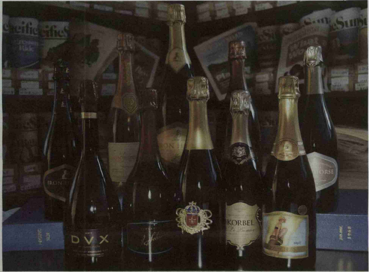
FUNNY THING ABOUT TIME What we drank—plus, a revealing look into our highly advanced archival system!

($30) The multi-year drought continued to dwindle the North Coast grape crush in 2015, but this assertive, salmon-pink bubbly is so modestly priced, for a reserve wine of just 1,000 cases made, you can easily irrigate a small crowd—but you have to go to the tasting room or website to find it. Crème fraîche and nectarine notes pleased the Boho crowd, anyway. What's that, the drought is back? Drink up! ★★★★★ B