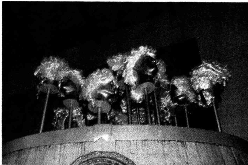
Les Libertines Cellar evokes the spirit of the French revolution at DeLoach Vineyards.

More information about "the Renaissance of DeLoach" is available online at DeLoachVineyards.com .