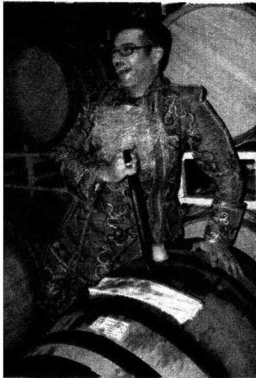
Visitors can taste wines thieved from the barrel in the Royal Barrel Cellar at DeLoach