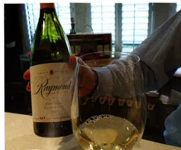
Raymond Napa Valley Chardonnay