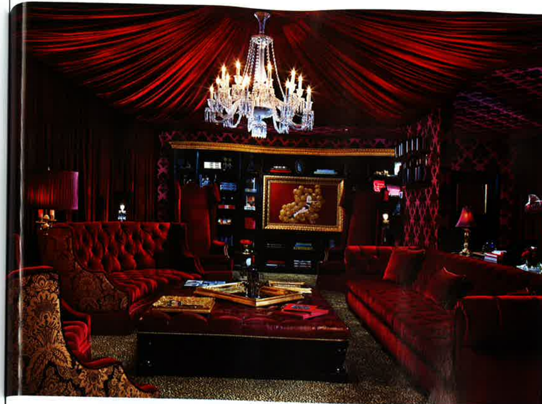
Top: The Red Room