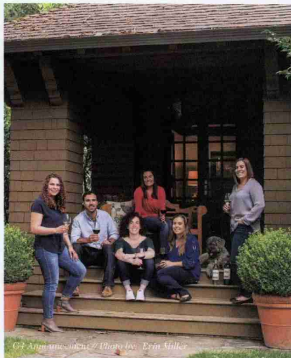
G4 Artisans at work.