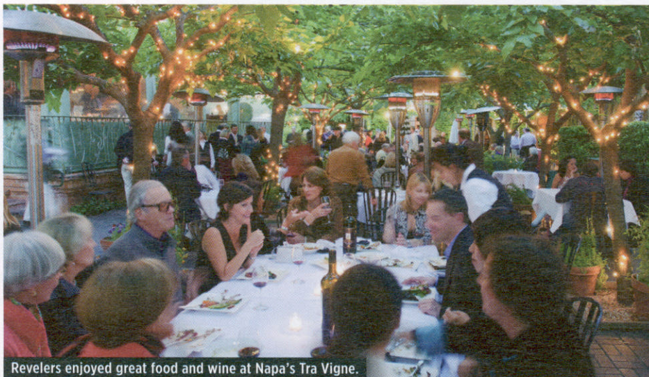
Revelers enjoyed great food and wine at Napa's Tra Vigne.

Wine poured freely from magnums provided by the guests, such as the Joseph Phelps Insignia Napa Valley 2006 and the Shafer Cabernet