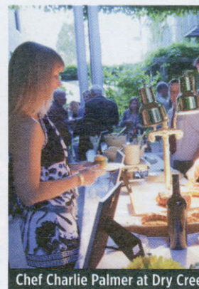
Chef Charlie Palmer at Dry Cree

Sauvignon Stags Leap District Hillside Select 2005, and included older wines like Robert Mondavi Cabernet Sauvignon Napa Reserve 1987, Turley Zinfandel Dry Creek Valley Grist Vineyard and Beringer Cabernet Sauvignon Napa Valley Private Reserve. Guests enjoyed pastas, wood-fired pizzas, quail, steak and cal