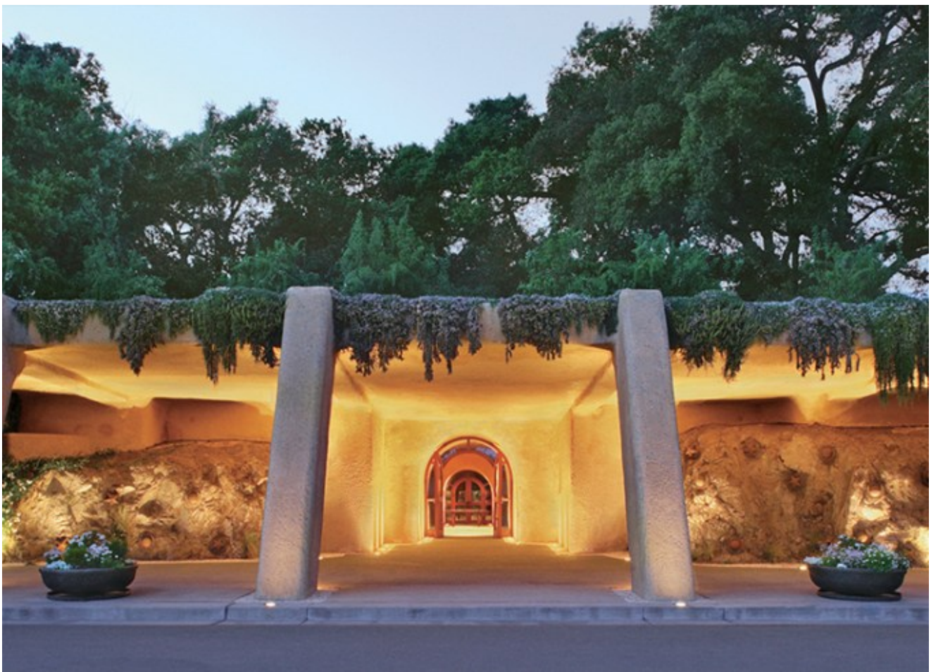
Stag's Leap Wine Cellars

707-257-5749, 1960 S. Helena Hwy., Rutherford, CA, 94573; bvwines.com