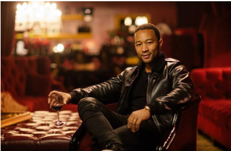
John Legend in The Red Room at Raymond Vineyards

And now, you can have your own bottles of LVE. Visit www.LVEwines.com and www.raymondvineyards.com for more information.