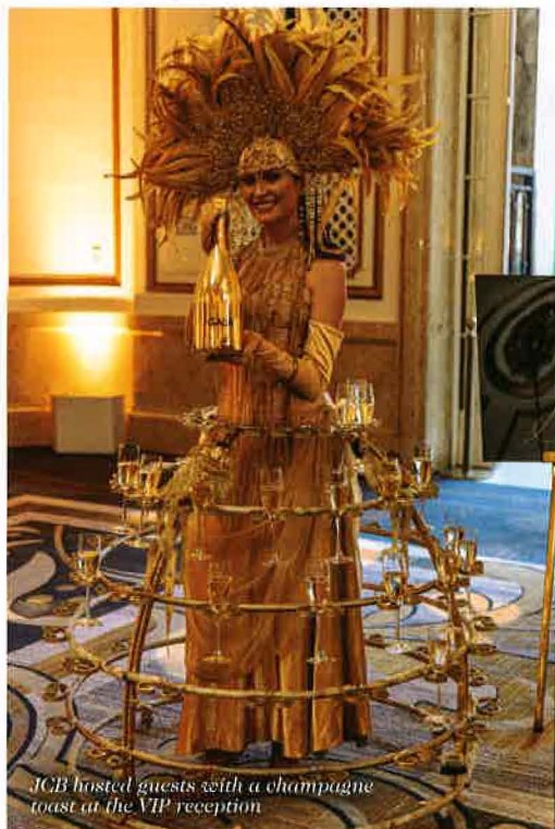
JCB hosted guests with a champagne toast at the VIP reception