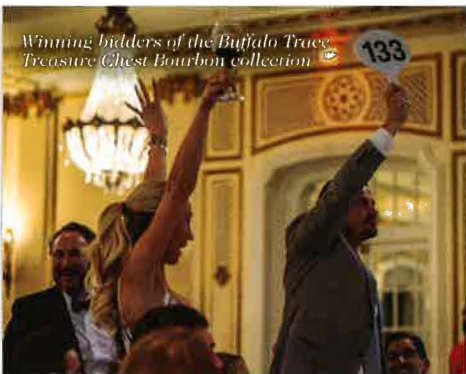
Winning bidders of the Buffalo Trace Treasure Chest Bourbon collection