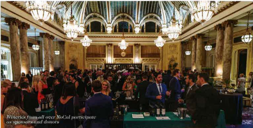
Wineries from all over NoCal participate as sponsors and donors