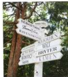
FROM LEFT: BUENA VISTA WINERY, FOUNDED IN 1857; CYCLING PAST VINEYARDS; SIGNS POINT TO WINERIES.

While Sonoma Valley offers winding, tree-lined roads, Napa is nestled in a narrower valley, making the bike routes between the city of Napa and its neighboring Yountville, Oakville and Rutherford long (often 15-mile) routes that often include bustling roadways (with bike lanes or bike-friendly shoulders). It can be hard to find quick food during a bike ride in Napa, so you should arrange for a bike tour that includes a meal, or stop in Napa for picnic fixings. Napa's Oxbow Public Market is a lovely place to