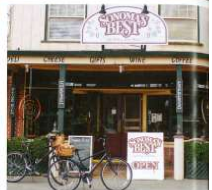
CLOCKWISE FROM LEFT: CYCLING PAST SONOMA HISTORIC STATE PARK WITH SONOMA VALLEY CYCLERY; RUTHERFORD HILL WINERY'S OAK GROVE IS PERFECT FOR PICNIC LUNCHES; SONOMA'S BEST MARKET LOCATED IN THE TOWN OF SONOMA IS A CONVENIENT STOP FOR PICNIC PROVISIONS.

Similar to their Mediterranean counterparts, Napa Valley and Sonoma Valley benefit from an oceanic climate on account of their proximity to the San Francisco Bay. The temperate conditions of cooler summers and gentle winters work with the unique terrain of Napa and Sonoma to create microclimates that are optimal for growing a variety of wine grapes. Add to these favorable weather patterns the region's rich soil, and you start to understand why these long, narrow Northern California valleys are a treasure trove for wine enthusiasts seeking out Cabernet Sauvignon, Merlot, Zinfandel, Pinot Noir, Chardonnay, Sauvignon Blanc and more. Beyond being well suited for growing wine grapes, the exceptional topography and climes of Sonoma Valley and Napa Valley make them stunning places to explore by bike. Whether you're looking for a meandering cruise or challenging cycling