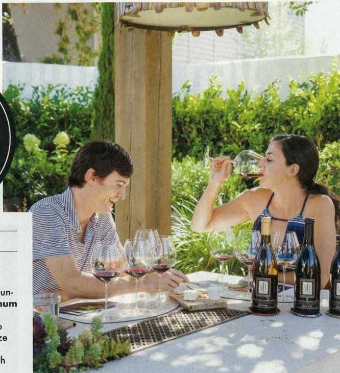
FROM TOP Garden tasting table at Three Sticks Wines; Three Sticks mural by artist Rafael Arana.

3. A HIKE WITH CABERNET The word "park" in Bartholomew Park Winery is to be taken literally. The tasting room is in 400 acres of old oaks and madrones, surrounded by the Cab-friendly Mayacamas Mountains. A museum includes Victorian photographer Eadweard Muybridge's photos documenting viticulture back in the day. $10 tasting; bartpark.com .