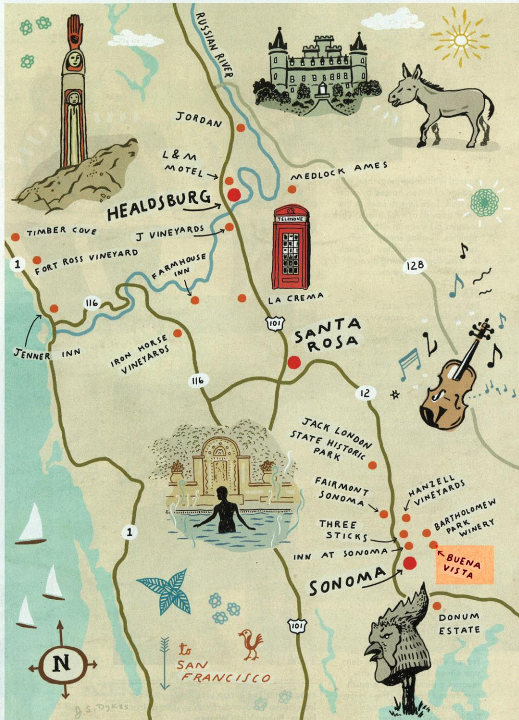
Illustration by JOHN S. DYKES

At nearly 1,600 square miles, Sonoma County is vast. Plan a getaway that lasts a day or week, with activities centered in different parts of the region (pages 22–24), and lodging options in each (page 26).