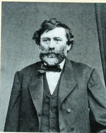
(clockwise from above) A portrait of Buena Vista Winery’s founder, Hungarian Count Agoston Haraszthy; the winery’s bottling line in 1865; the Buena Vista wine cellar in 1865; actor George Webber portrays Count Haraszthy during winery tours today.