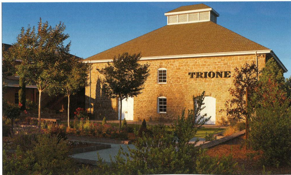
Trione Vineyards and Winery in Geyserville.

Hanzell Vineyards, 18596 Lomita Ave., Sonoma, 707-996-3860, hanzell.com. Open by appointment only, via CellarPass (cellarpass.com), Hanzell is well worth the effort, a legendary property and producer of age-worthy, structured and elegant Chardonnays and Pinot Noirs. The Heritage Winery Tour ($45) begins in the Ambassador's 1953 Vineyard and goes through the winery and barrel-aging cave before a sit-down tasting of current wines. The more in-depth Private Estate Tour ($65) takes visi-