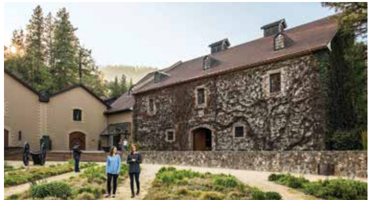
CLOCKWISE FROM TOP A tasting room in Chateau Montelena's 1888 Gothic-style winery building; visitors explore The Hess Collection's gardens; the entrance to the art museum and the tasting room at The Hess Collection

The second floor, where grape juice originally fermented in large tanks, currently houses offices. The ground floor has been brought back to its original use as a barrel aging space and also houses the glamorous new Bubble Lounge, a chandelier-lit bar for tasting sparkling wine. Even the Count has returned, in the form of that flamboyantly dressed actor who greets visitors.