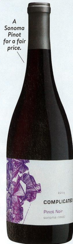
A Sonoma Pinot for a fair price.