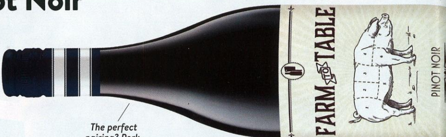
The perfect pairing? Pork, of course.

This peppery Pinot comes in 12-ounce cans, too.