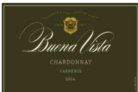
Buena Vista 2014 Carneros Chardonnay