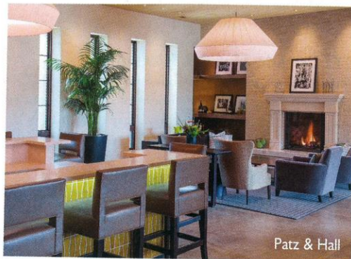
Patz & Hall

minutes of Sonoma Plaza have joined together to provide visitors the best possible experience in Sonoma County. Their Wine Trail Pass is a very generous deal.