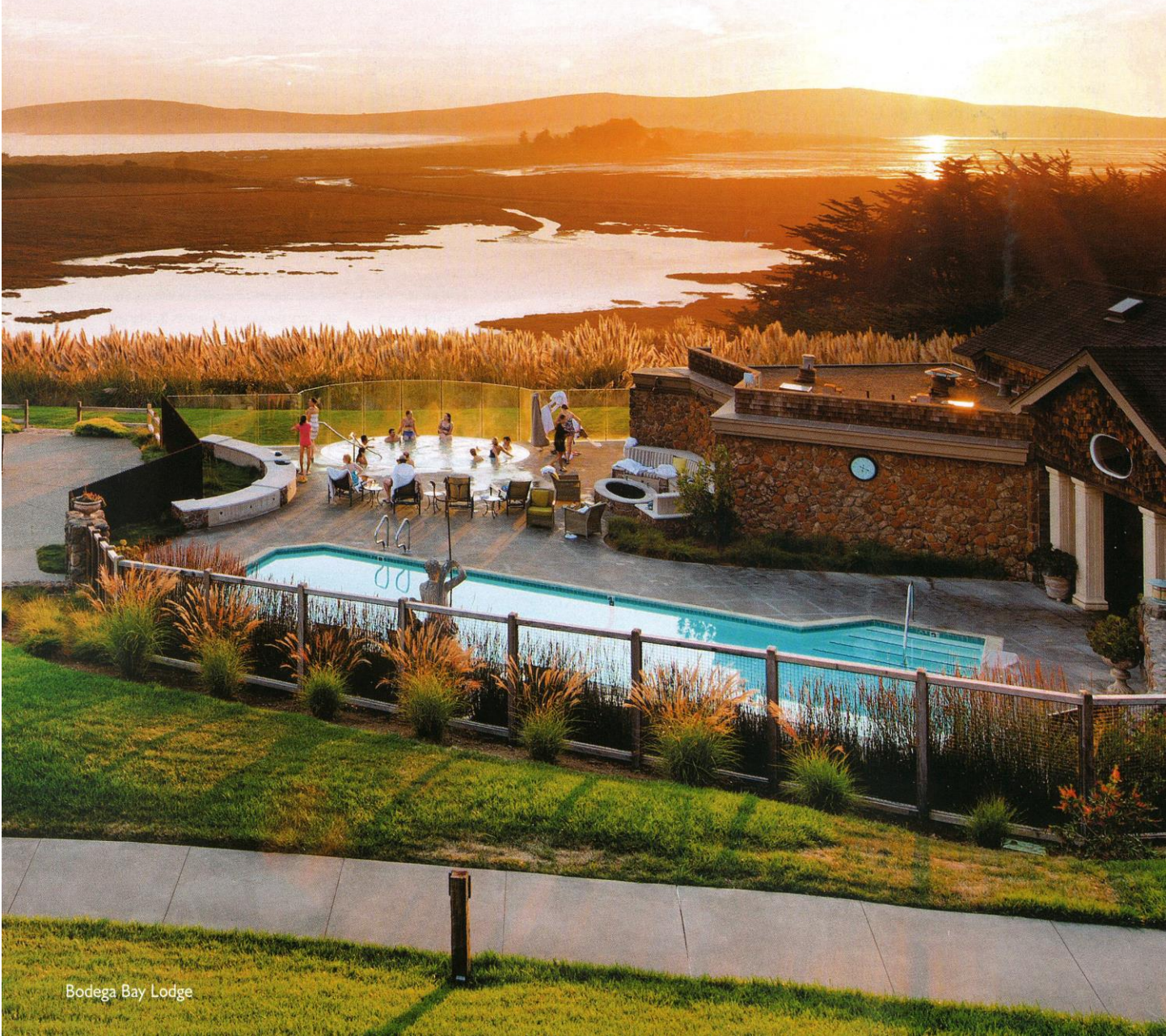
Bodega Bay Lodge

Located less than an hour north of San Francisco's Golden Gate Bridge, between the Pacific Coast in the west and the Mayacamas Mountains in the east