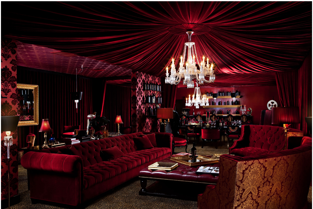
Above: The plush Red Room Salon, the perfect setting for serving the Raymond Surrealist (right) a complex, cellar-worthy Cabernet Sauvignon and Petit Verdot

We settle in the private Red Room salon with bottle-service. Appointed, as its name indicates, in lush red upholstery, the seductive room is as sensual as the wines we are about to taste. “So, are you a French vigneron in California or a Californian vigneron in France?” I ask.