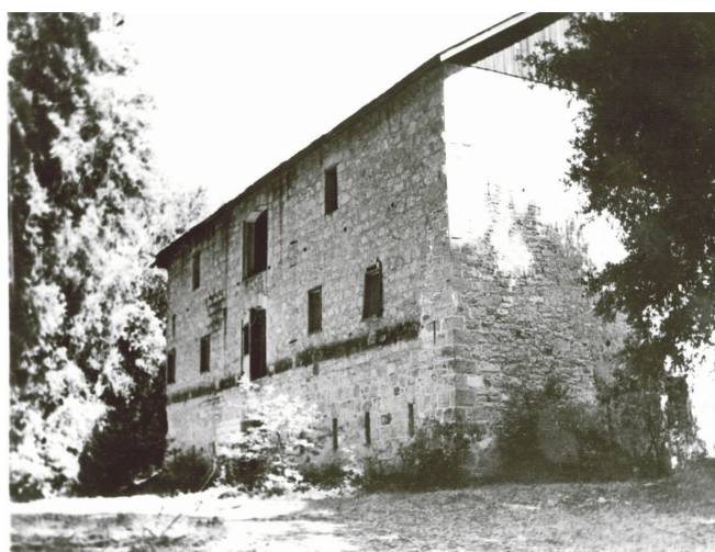
Top: Buena Vista Winery at night. Above: Buena Vista Champagne Cellar 1865

four-year extensive renovation programme, restoring the historic winery to its original grandeur.