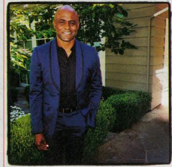
Tony Award-winning actor Wayne Brady hosted the Imaginarium Gala at Meadowood Resort .