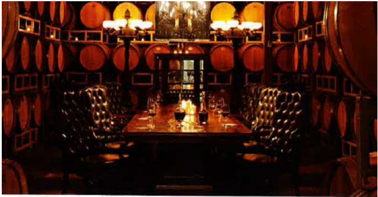
Tastings in Raymond's atmospheric Barrel Cellar include wines that are still aging.