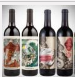
ROB MURRAY VINEYARDS