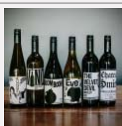
CHARLES SMITH WINES