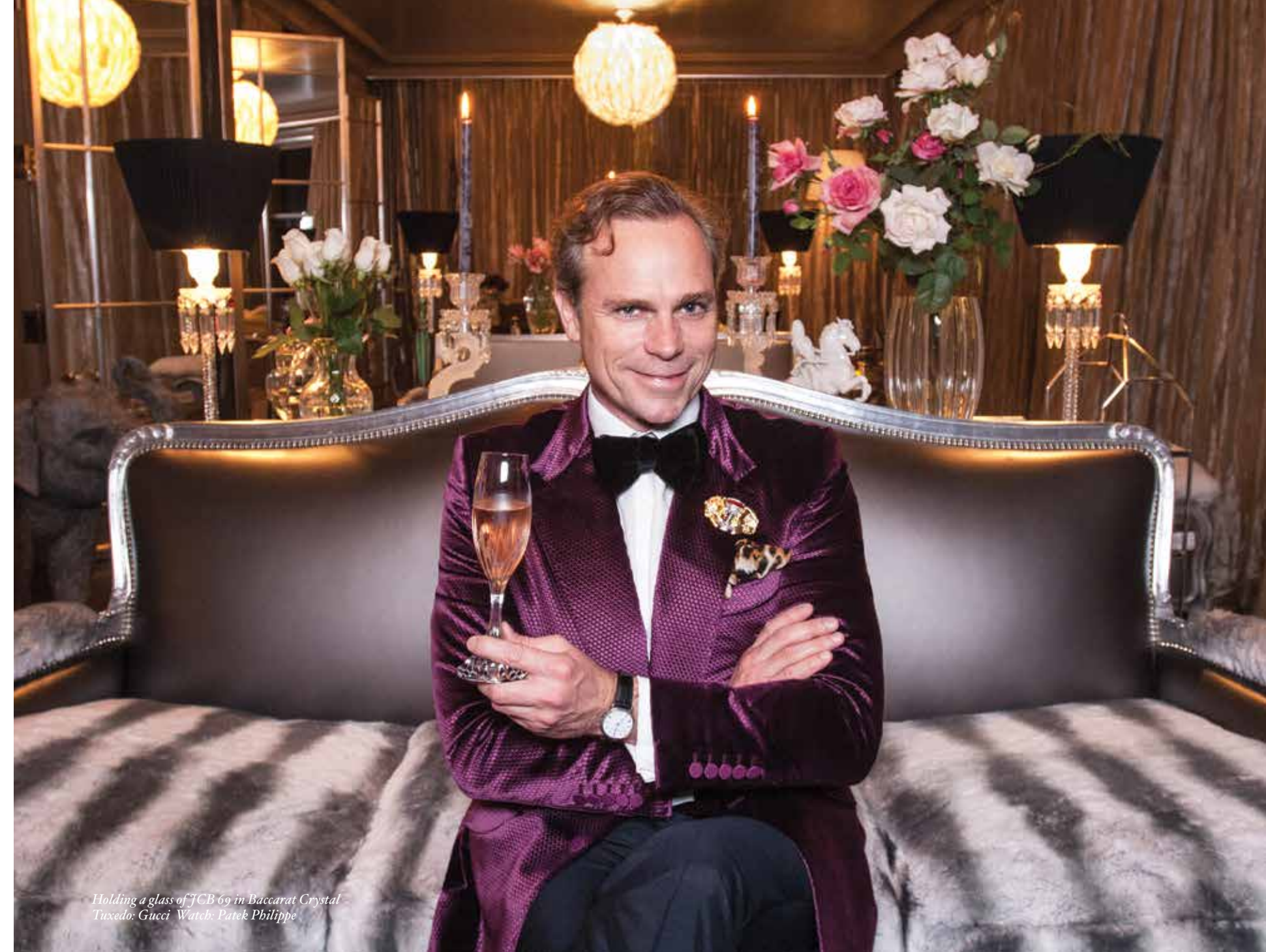
Holding a glass of JCB 69 in Baccarat Crystal Tuxedo: Gucci Watch: Panik Philippe

The purchase of Mondavi's estate is significant, as the now-deceased vintner is considered to be the pioneer of Napa Valley. In a similar fashion to the wine