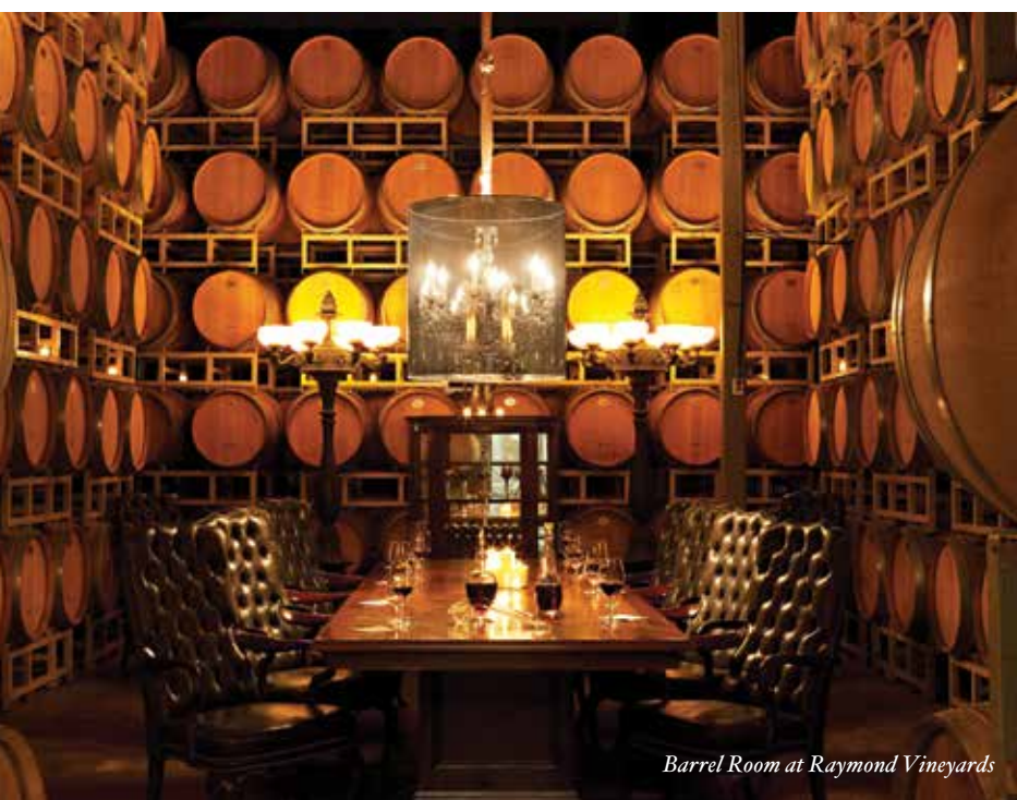
Barrel Room at Raymond Vineyards