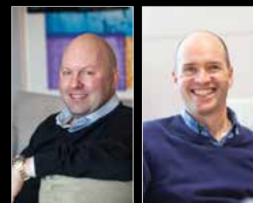
MARC ANDREESSEN AND BEN HOROWITZ