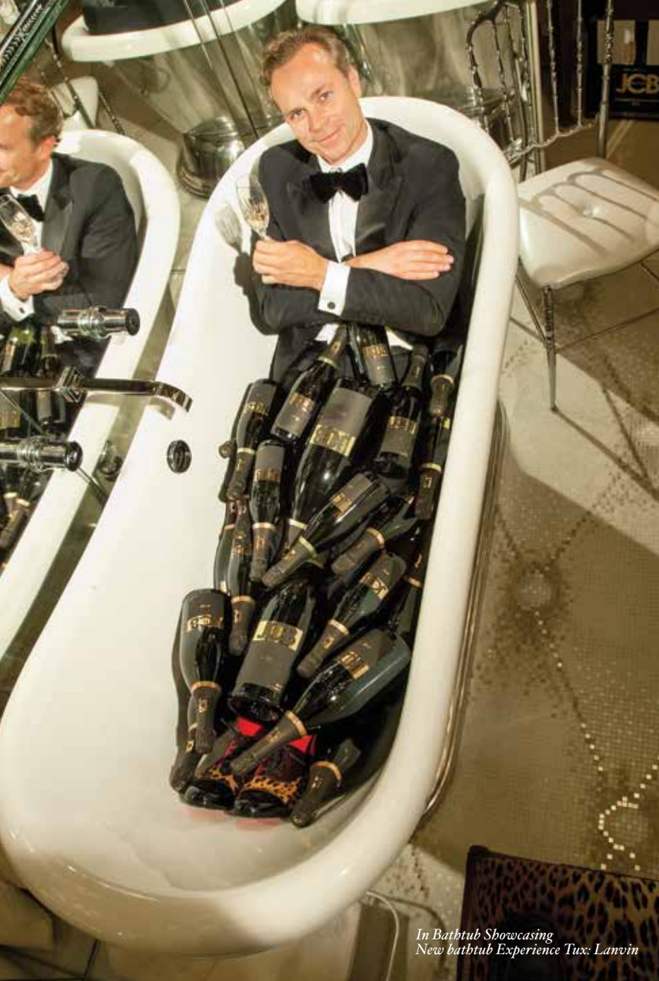
In Bathtub Showcasing New bathtub Experience Tux: Larvin