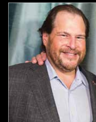
MARC BENIOFF CATEGORY: BILLIONAIRES COMPANY: SALESFORCE INDUSTRY: TECH / PHILANTHROPY WHAT MAKES HIM HAUTE: