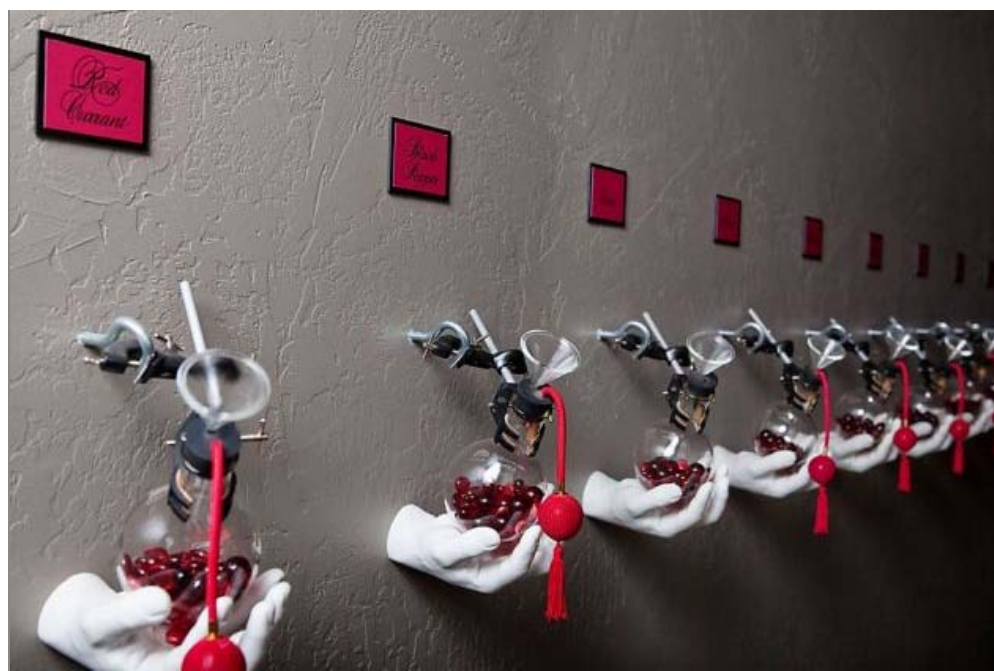
In the hall gallery of senses, guests can play with perfume bottle-style sniffers showcasing the aromas often found in wines, helpfully labeled above.