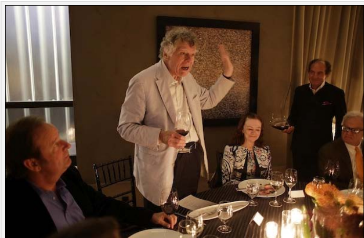
Gordon Getty speaking at the CADE Estate party