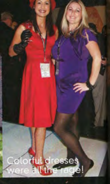
Colorful dresses were all the rage!