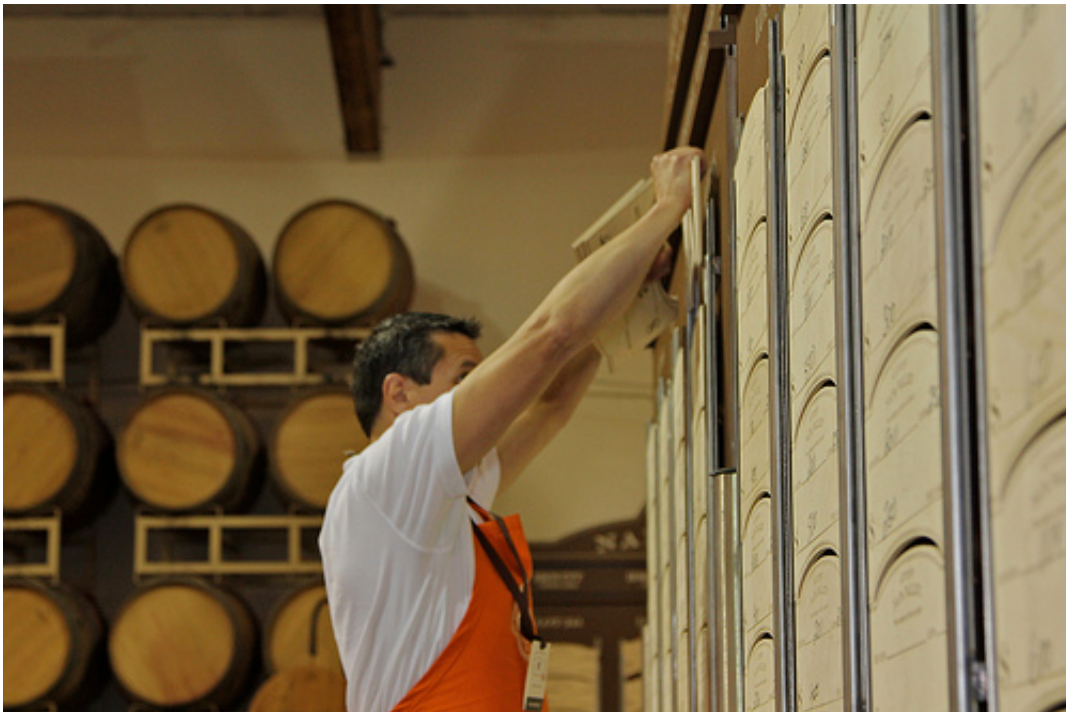
The big board of barrel lots.