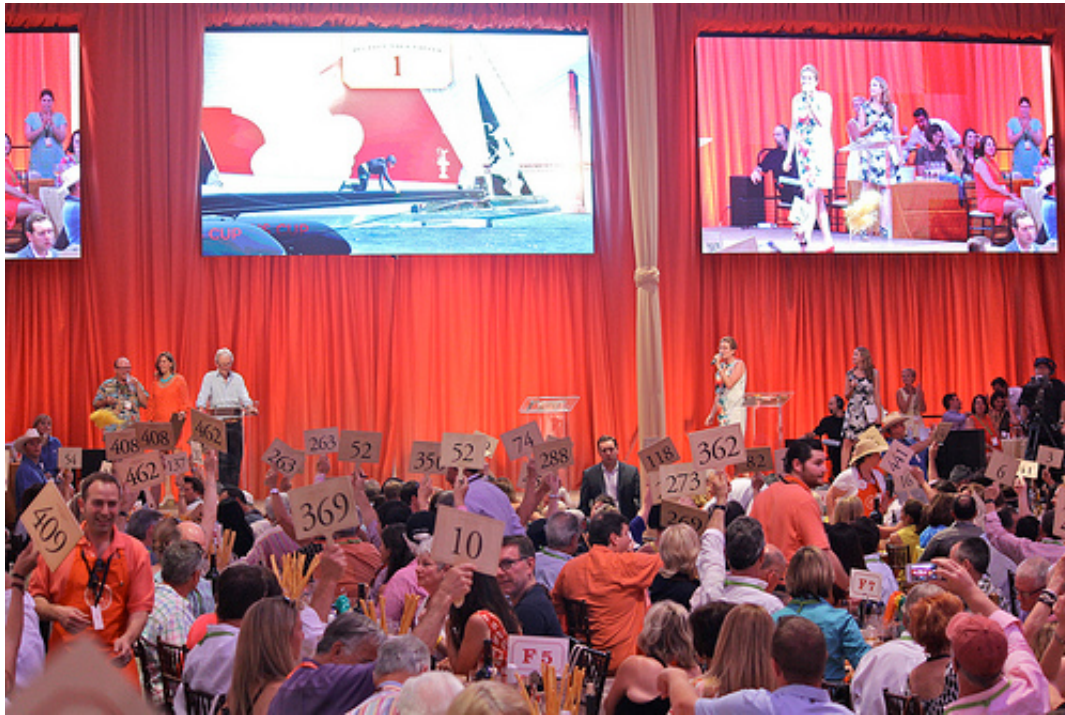
Look at those paddles fly!