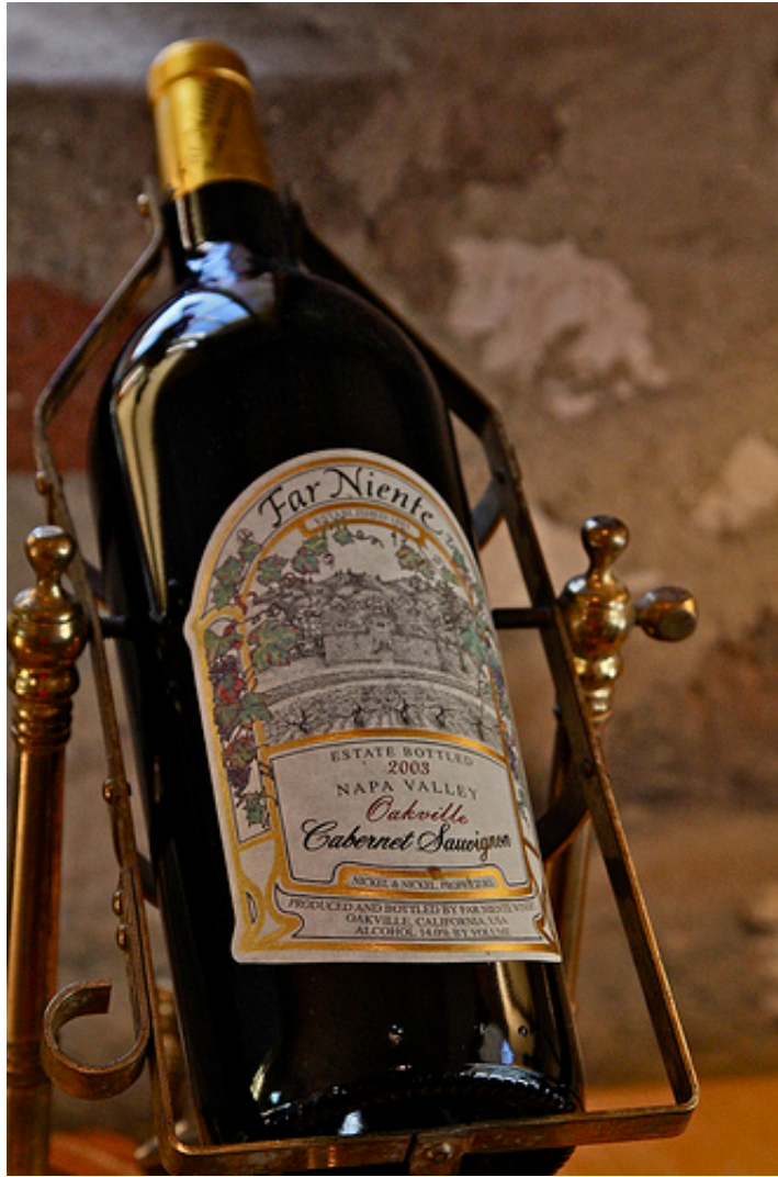
Far Niente Winery, the hosts of An Evening with Lamborghini.