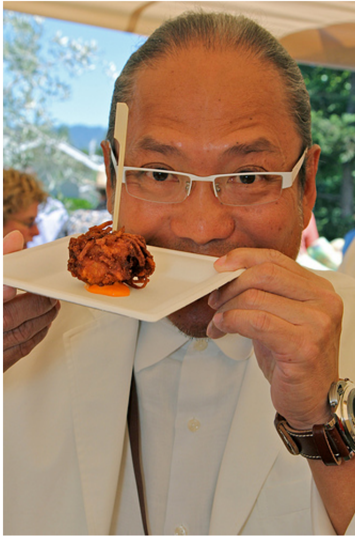
The one and only Iron Chef Morimoto serving up his awesome Korean corn dogs.