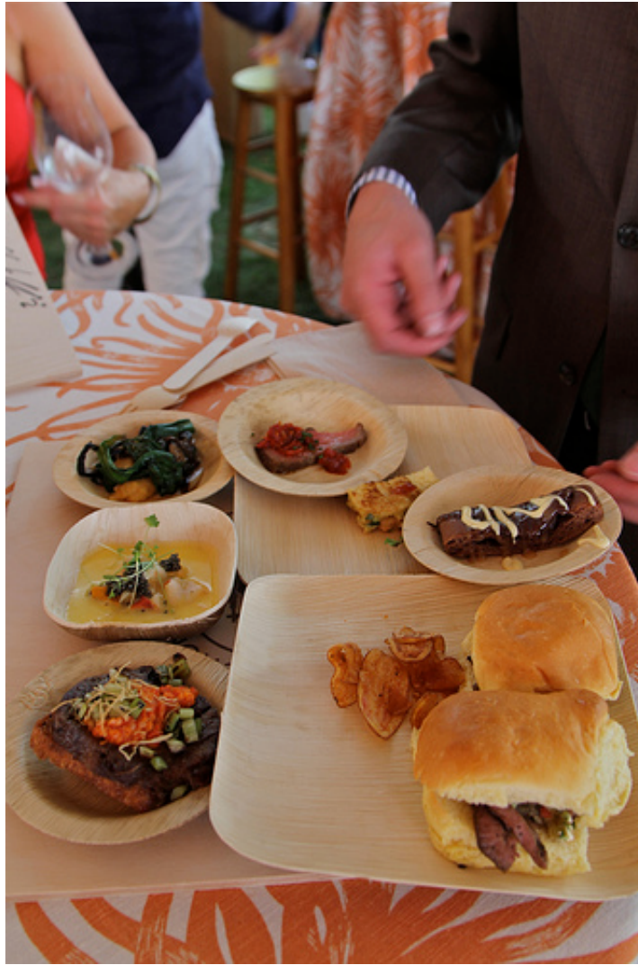
Delicious dishes at Auction Napa Valley.