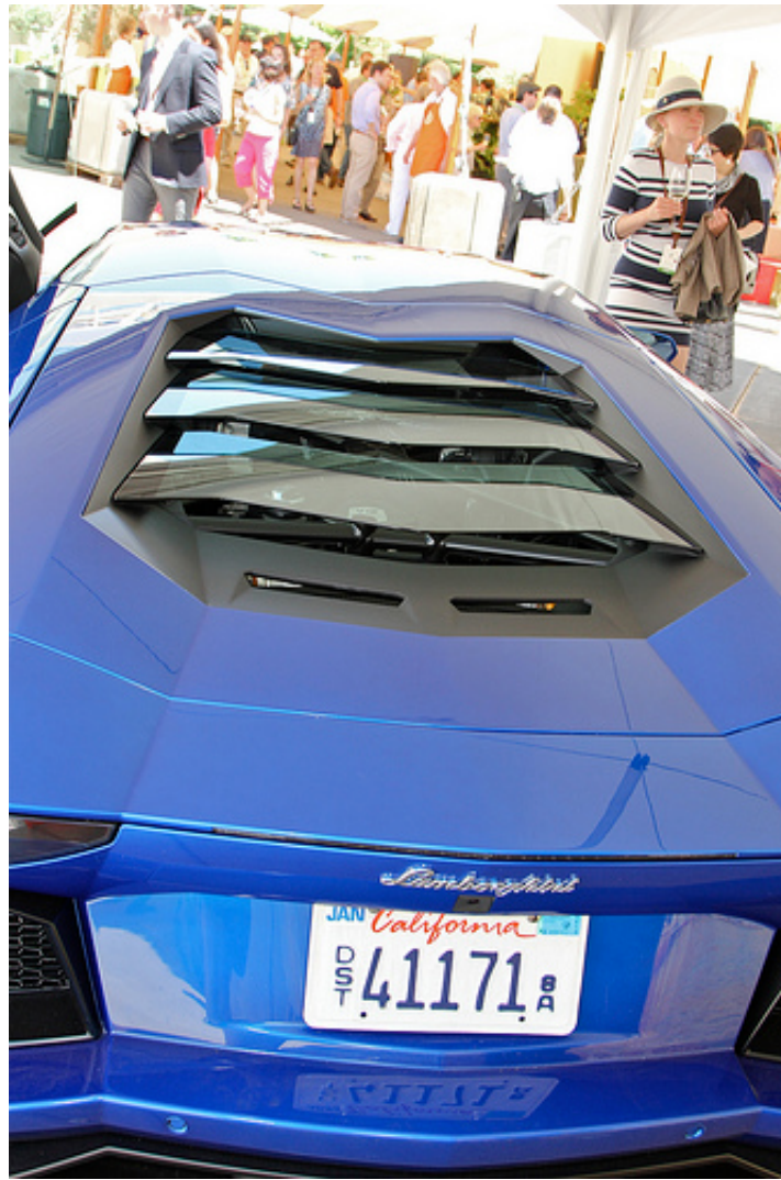
Far Niente Winery's auction lot . . . a Lamborghini.