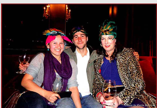
Partygoers in the Red Room

I found each room contained a distinct wine offering as well as tasty appetizers.