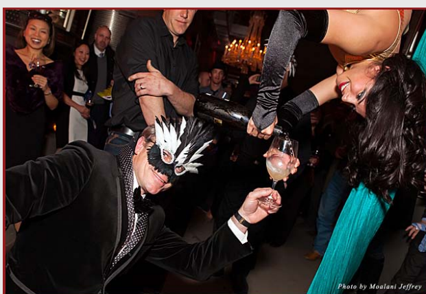
Pouring champagne at Napa Gras

Ever wondered how the Napa Valley parties? With wine of course! Most of the time Napa is a casual place, but when they decide to celebrate they pull out all of the stops. I was lucky enough to attend a couple of high profile events to see for myself what goes on after the tourists go home.