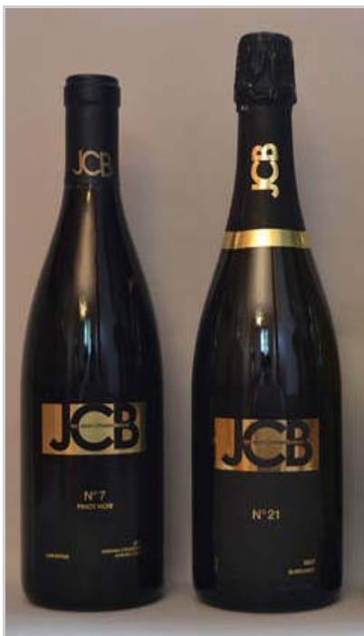
High-class vintage: The JCB line is a limited series of numbered wines expressing style and transcending fashion.