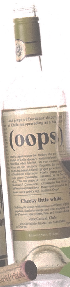
(OOPS) CHEEKY LITTLE WHITE SAUVIGNON BLANC A citrusy hit, emp before the tasting over. $11