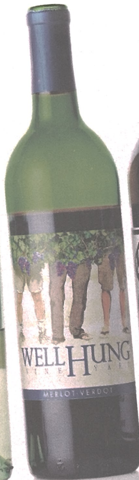
WELL HUNG MERLOT-VERDOT A smooth, earthy sip that's definitely not your mother's merlot. $20