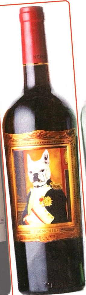
FRENCHIE 2009 NAPOLEON RED An intense, oaky red blend that made us think about our favorite steak recipes. $30