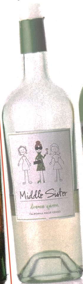
MIDDLE SISTER DRAMA QUEEN PINOT GRIGIO A crisp, fruity find that got nabbed for one editor's seafood dinner. $12