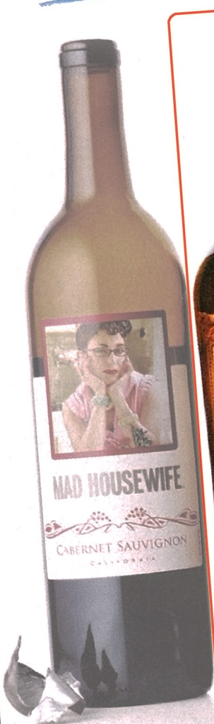
MAD HOUSEWIFE CABERNET SAUVIGNON A not-too-sweet companion for pizza night—or girls' night. $10

Buy wine because of a funny label and you kind of expect to forgo flavor for a few laughs. But after tasting the kookiest of the crop, we found the bottles that don't require the trade-off! BY ALLYSON DICKMAN