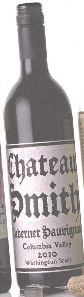
CHATEAU SMITH 2010 CABERNET SAUVIGNON A robust red that may induce serious burger cravings. $20