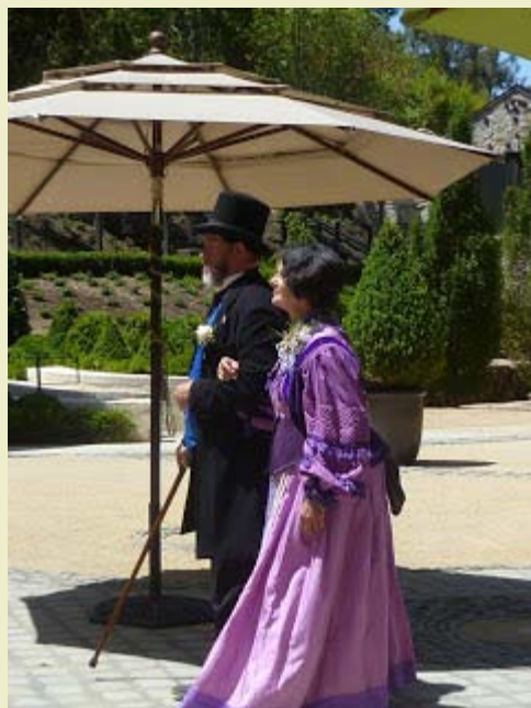
Count Haraszthy and his wife, Eleonora, walk down the aisle.