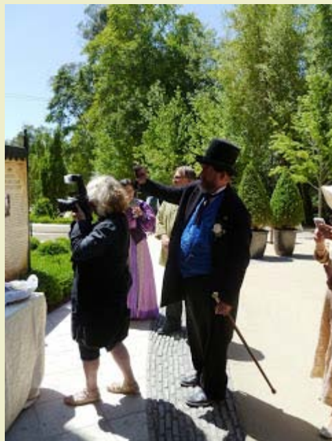
My favorite "What century am I in?" moment of the day, wherein Count Haraszthy can be seen taking a photo.