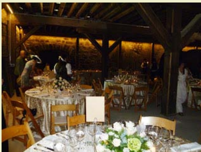
Preparing tables for the feast.