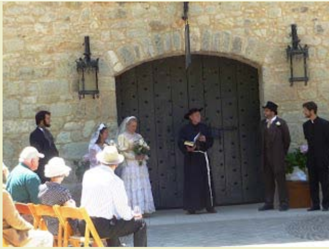
The priest stands waiting, the two couples at his side.