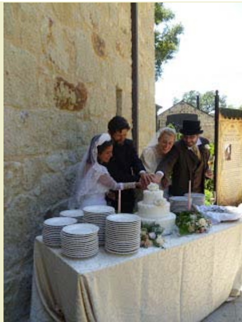
Cutting the cake.