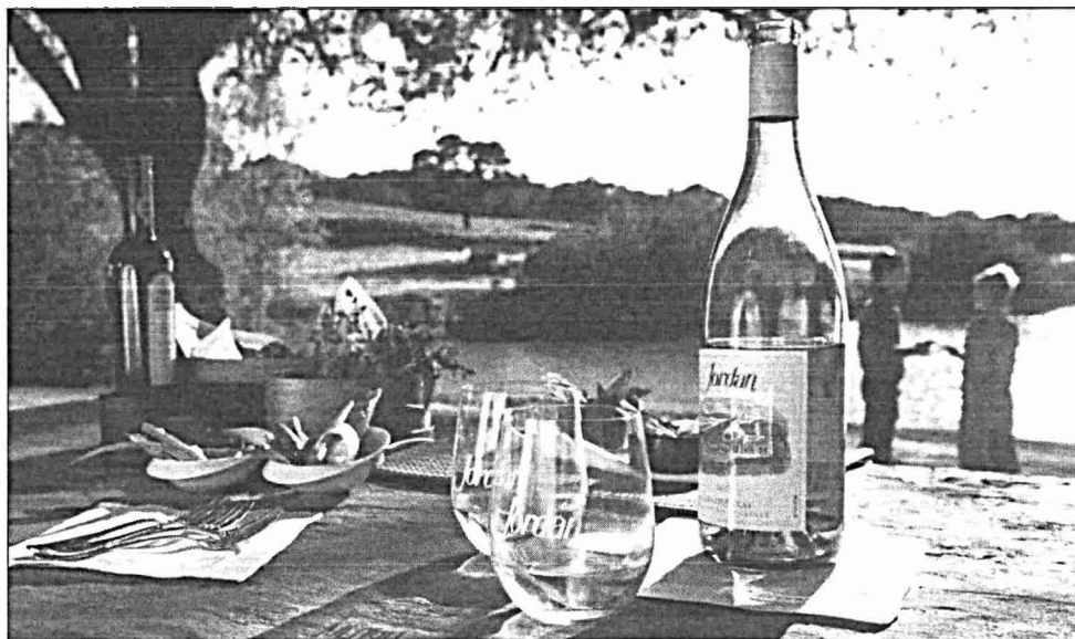
The grand French chateau of Jordan Wine Estate in the Alexander Valley of Sonoma includes two lakes on 1,200 acres.