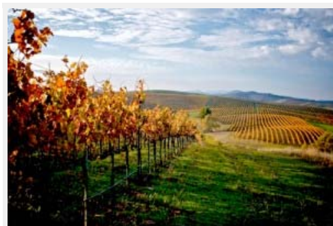
Robert Sinskey Vineyards

patch as you walk along the organic garden. Wind through the volcanic rock caves before you stop on the cozy patio, where you'll find bountiful plates of salumi, housemade jam, Marcona almonds and plenty of stellar wines.