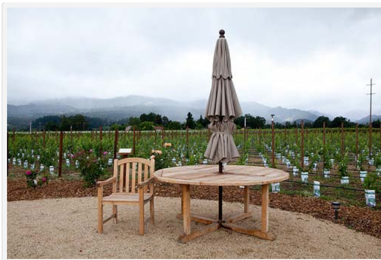
Driving through Napa; at Raymond Vineyards outside