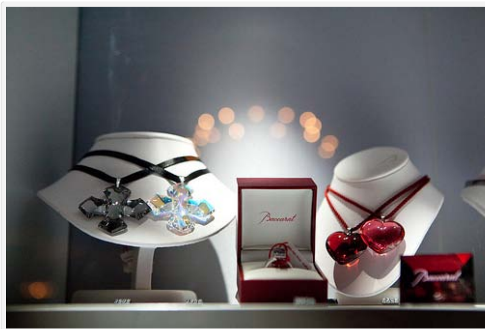
At the Crystal Room/Cellar with Baccarat crystal objects

Entering the building and turned right and straight down the hall is their Crystal Cellar. This dark, club-like atmosphere is mostly decorated of working stainless steel vats that second as walls, mirrored bar and decorated with the French luxury crystal Baccarat (the gorgeous chandelier and historical crystal decanters). They also do sell some of Baccarat's beautiful crystal jewelry and figurines. In this particular room, they have a special flight of four different vintages of Cabernet Sauvignon.