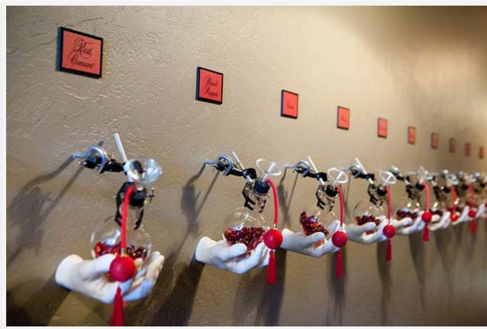
Corridor of Senses

There's the Corridor of Senses that could enhance or build up a wine taster's vocabulary. Visitors could touch different patches of fabric to get a feel how it's like on the palate. The aroma section, where there were hands with atomizers that one can squeeze and smell a certain scent like honey, blackberries, etc. that you would find in a glass of complex wine.