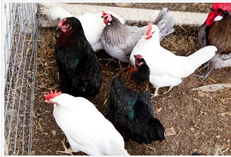
Some plants and farm animals seen at the Theater of Nature

This particular winery wanted to go beyond the traditional wine tasting route and have an interactive experience between the winery's grounds and the visitor. The first thing you'd notice when you walk on their grounds is the 1.5 acre Theater of Nature, especially with the crowing of a rooster. The concept is to educate visitors on the importance of sustainable, organic, Biodynamic farming. All of this is a self-guided area that you could walk around at your own pace or there's an audio guided tour by scanning their QR code with your smartphone and take it from there.