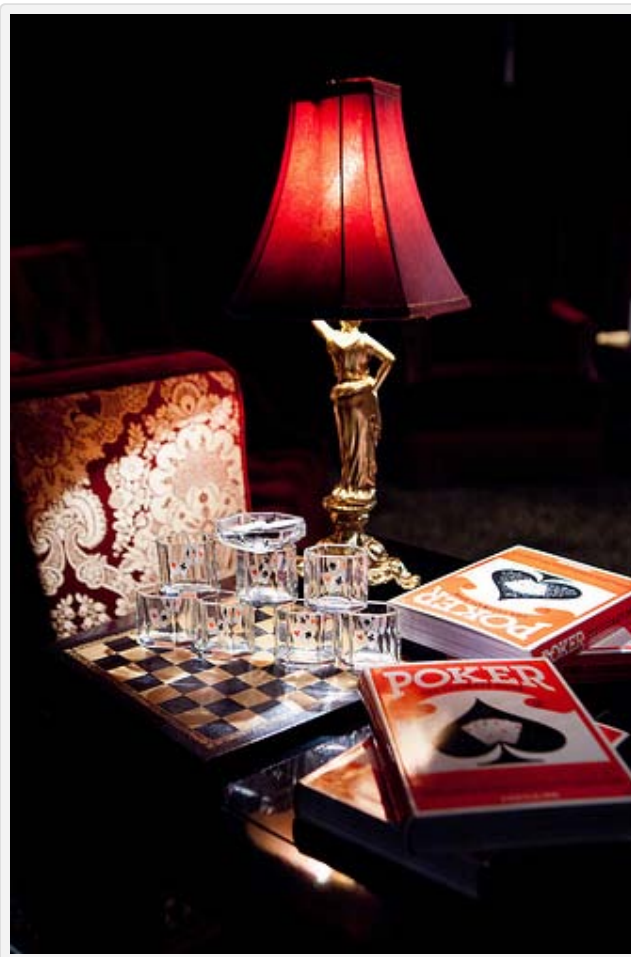
Inside the Red Room

The final room we visited prior to tasting was The Red Room, an exclusive room for its members. This very red, lush, dark and handsomely decorated room makes you want to relax. The furniture is plush and there were games like pool, chess, or poker, to play if one is interested in doing so. There's also a special red wine blend served only available to guests of this club.