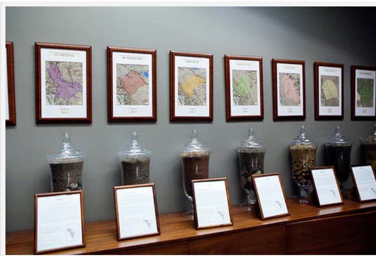
Barrel Room, Blending Room, Library Room, and Rutherford Room

There are other tasting rooms for private wine tasting and educational classes like the Barrel Room, Blending Room, Library Room, and the Rutherford Room. The Library is an exclusive room behind the main Tasting Room that offers vertical wine tastings of some of their older vintages dating back to 1974. The Barrel Room is surrounded by oak barrels on all sides and illuminated by candlelight. It's an intimate area to sample their wines.