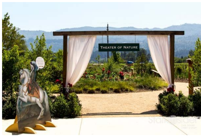
Theater of Nature: Raymond Vineyards, host of Day in the Dust 2012

A Day in the Dust, the annual trade tasting focused on Napa wines from Rutherford, was hosted this year by Raymond Vineyards. 2009 Cabernet Sauvignon and 2011 Sauvignon Blanc were featured.