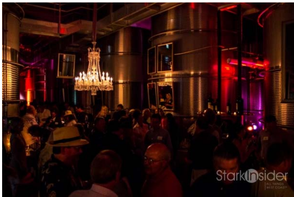
The Crystal Cellar – clubby atmosphere.

The wines themselves, especially the Cabs, did indeed exhibit that beautifully expressive Napa quality that many associate with the region: rich, fruit forward, layered. These are not wallflowers.