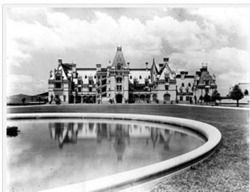
English: Biltmore House and reflections (Photo

Have you ever been inside Biltmore's Estate ? It's 175,000 square feet large, with 250 rooms... There are behind the wall passageways, which are hidden from the public. Servants used to travel through these hallways as they traveled to a room where a duty was to be performed. They even had