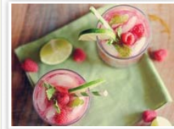
2 Raspberry Mint Mojitos by: eatyourselfskinny