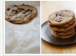
3 Jacques Torres's Chocola...