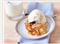
1 Peaches And Cream Cake by: RachelGTGF