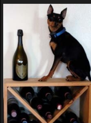
Fine Wine Design Canine