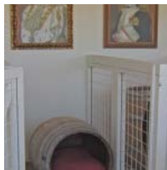
Barrels made into dog beds in Frenchie salon.

Inside Raymond's tasting room an entire shelf is devoted to dog paraphernalia – organic dog treats, water bottles, dog collars and of course frisbies. Now let's get to the Frenchie wine: the 2009 Napoleon is a blend of cabernet sauvignon, syrah, sangiovese and zinfandel – the wine exudes aromas of black and red fruit with hints of cassis that unneash in your glass. The blend is well balanced and although you'd think it would have a short finish, it's quite long! The Louis XIV cabernet sauvignon shows fetching aromas of blackberry and cocoa. Like Versailles, this wine has great structure.