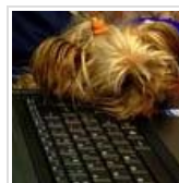
All Pets Go To Heaven Remix & High Times HoundsTable Scraps LinkWithin