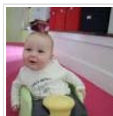
Check Meowt! Baby Edition