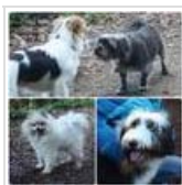
DeLaveaga Dog Parade Curbed