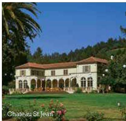
Chateau St. Jean

The Sonoma County Chardonnay offers scents of toasted praline, with oak that is still very present after three years, leaving marked flavours of tropical fruit on the palate. I really like the Robert Young Chardonnay which gives pride of place to elegance and refinement, offering fleshiness and