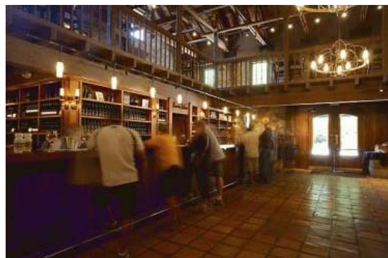
Lindsay Baum The tasting room features wood paneling.

PRINT E-MAIL SHARE COMMENTS FONT | SIZE: - +