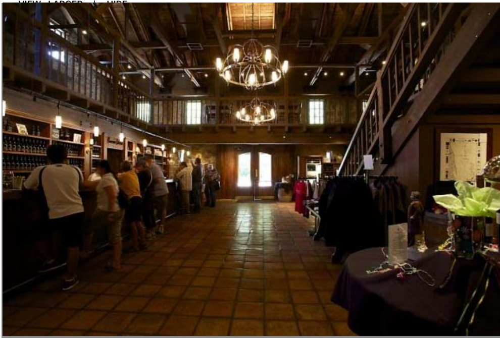
The tasting room at Buena Vista Winery, the state's oldest commercial winery, is housed in an old press room that dates back to 1862.