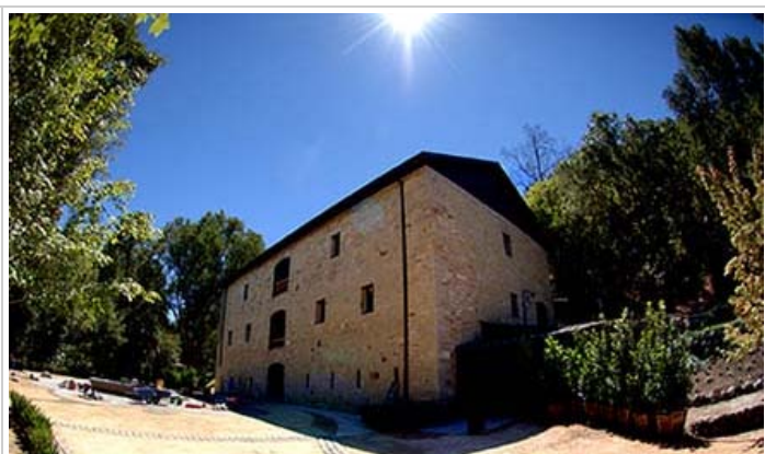
Buena Vista undergoes renovations in preparation for its grand opening tonight.