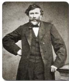
Count Agoston Haraszthy, Founder