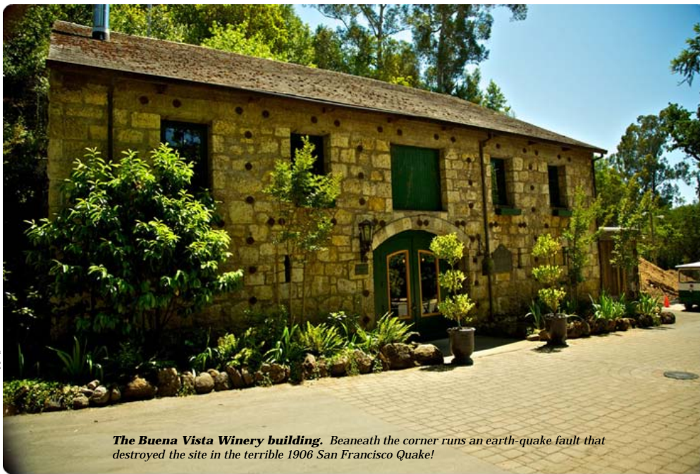
The Buena Vista Winery building. Beneath the corner runs an earth-quake fault that destroyed the site in the terrible 1906 San Francisco Quake!