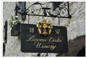
Buena Vista winery

heritage as the first premium and certainly the most colorful of all of the wineries in California and its founder, the self-proclaimed "Count of Buena Vista," Agoston Haraszthy , was a vivacious and eccentric pioneer with a veritable love and unending commitment to California wine.