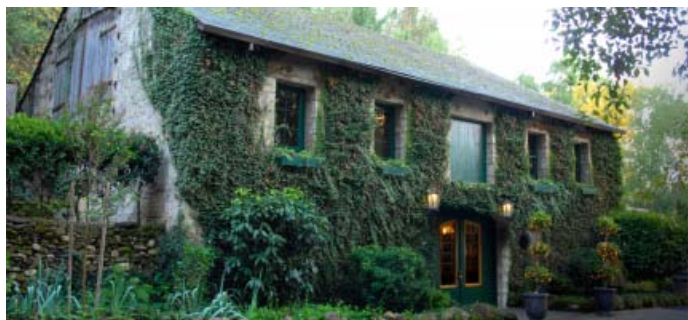
Buena Vista: 'communicating the history of California'

Boisset Family Estates plan to recreate wines from the 19th century at California's prestigious Buena Vista winery.