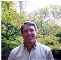
Farm Bureau honors Lincoln as 2012 Agriculturist of the Year

Grapegrowers update: The outlook is optimistic