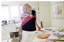
A biographical 'Sketchbook'