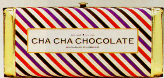
Cha Cha Chocolate Clutch Kate Spade, Fashion Show