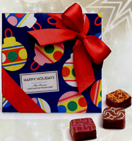
Nine Bonbons Max Brenner, Chocolate by the Bald Man Forum Shops

FIKA Espresso Bar "Seven Deadly Sins" Gift Box, www.fikanyc.com