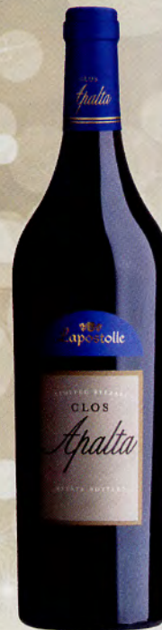
Lapostolle's Clos Apalta 2008 complements rich chocolate desserts www.lapostolle.com

Raymond Vineyards Generations Cabernet Sauvignon www.raymondvineyards.com