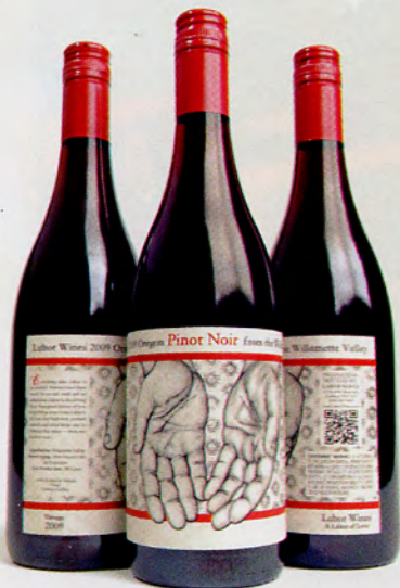
Labor Wines' 2009 Pinot Noir from Oregon's Willamette Valley www.LaborWines.com