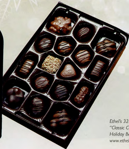
Ethel's 32-piece "Classic Collection" Holiday Box www.ethelm.com