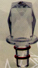
Louxor Stopper Baccarat, Forum Shops

FIKA Espresso Bar "Seven Deadly Sins" Gift Box, www.fikanyc.com