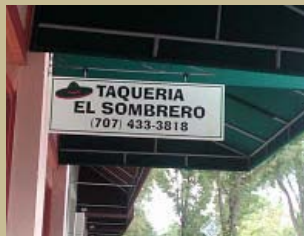
The view from my sidewalk table...

By the way - when it was time for lunch - I had three Carne Asada Tacos that were nothing less than a Mexican flavor explosion. The only difference between this place on the edge of the Healdsburg square and the best Mexican food places in LA - El Sombrero serves wine. They also feature a flaming selection of salsas which along with the complimentary chips - it's not a bad way to "tweak your palate" for more trips to the tasting rooms.