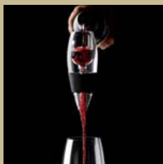
Great Gift. Must have item for the Red Wine Lover

Click Here to see my no reserve e-bay auction on the Vinturi Red Wine Aerator