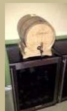
My Very Own Barrel!