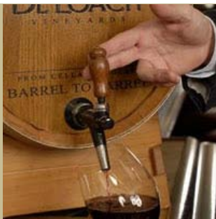
At a party - this barrel gets action!