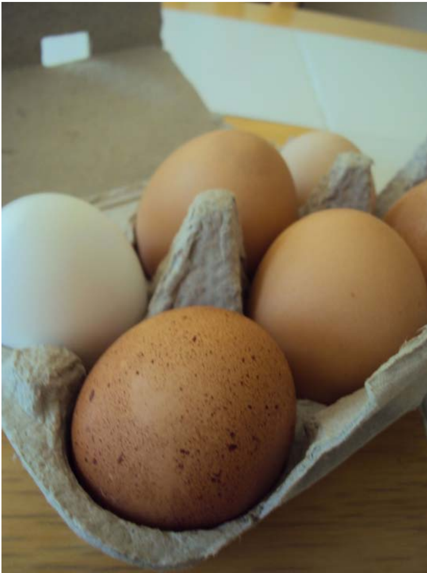
Farm-fresh eggs come in various colors, shapes and sizes.

These healthy hens are part of DeLoach Vineyards' rich, organic ecosystem created under Biodynamic standards. They forage for food and eat a natural diet that consists of seeds, plants, insects, worms and grains. This diverse food choices starkly contrasts with that of factory farm chickens, which are usually fed cheap, additive-laced corn, soy and cottonseed meals. This results in inferior eggs that lack richness, body and texture; you can taste the difference between eggs from farm-fresh and factory-fed chickens!