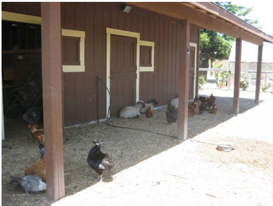
Chickens and sheep rest in the shade at the DeLoach estate.