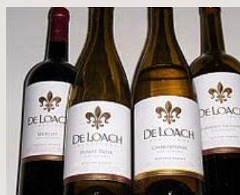
DeLoach Vineyards in Sonoma County makes quality wines at bargain prices.