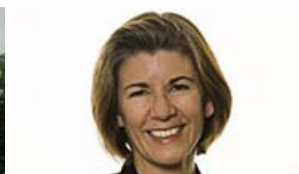
Need advice? Ask Amy