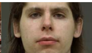
Mugs in the news