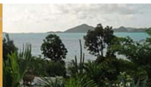
Your travel photos